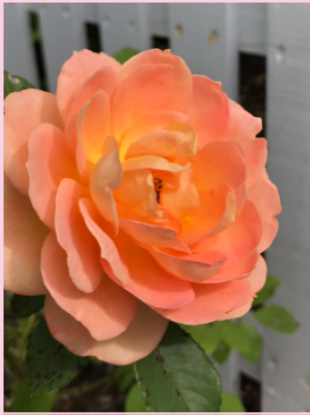
Lady of Shalott