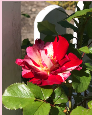
Fourth of July