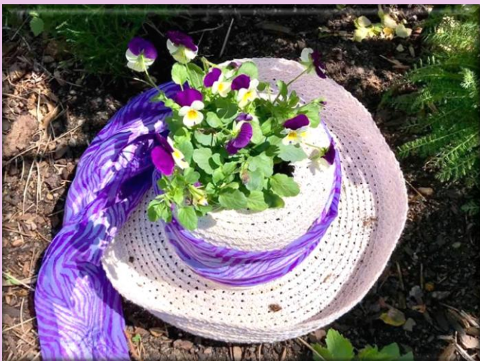
Our volunteers had so much fun creating Blossoms in Bonnets as a special exhibit for April. Now they delight the eye throughout the gardens