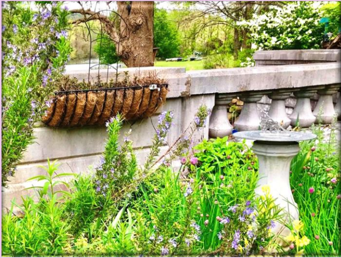
Our herb garden is home to all types of herbs--fragrant, medicinal, culinary and ornamental.