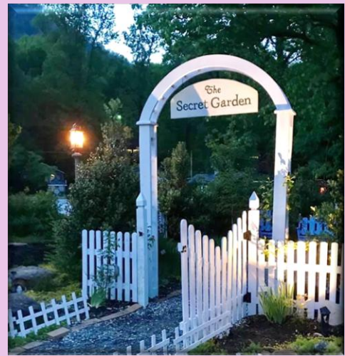
The Secret Garden gate invites visitors to enjoy its peace through the day and into the magic of twilight.