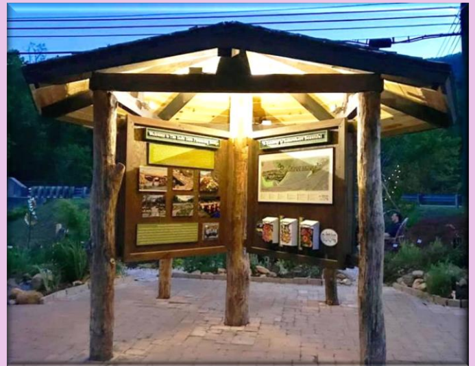
The kiosk at twilight. Located in the Chimney Rock end of the gardens, it features information about the gardens and the Hickory Nut Gorge for our visitors.