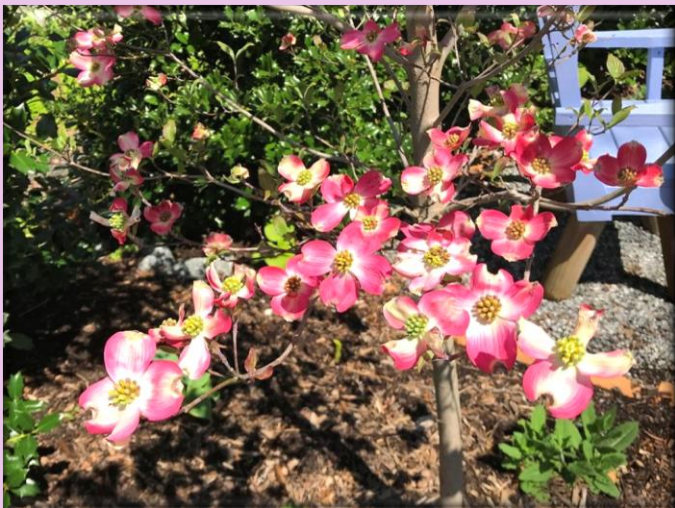
One of the great joys of spring, the pink dogwood beautifies our gardens.