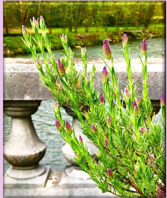
Spanish lavender graces the balustrade overlooking the Broad River below the bridge.