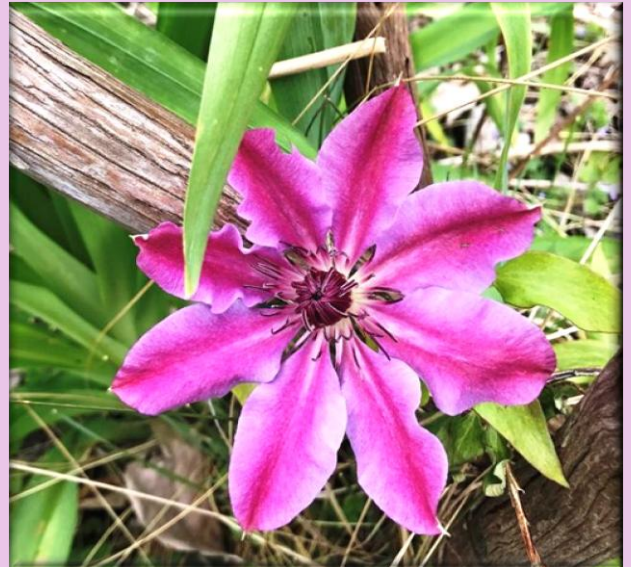
Clematis "Nelly Moser" has been a popular flowering vine since 1897.