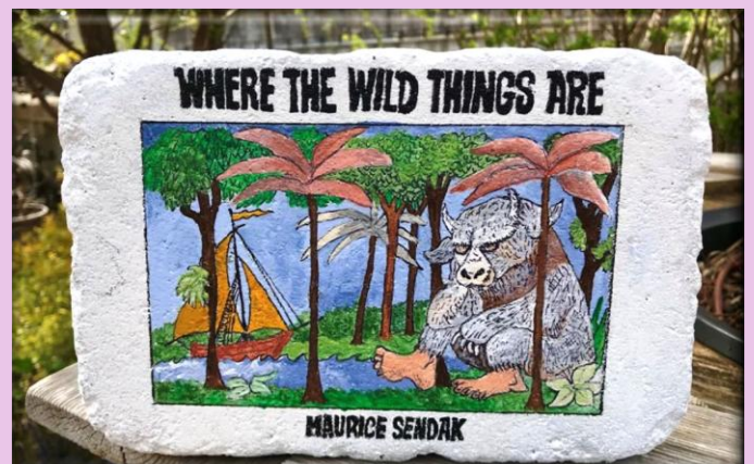
One of the many "books" in the ongoing exhibit we call "The Language of Flowers."