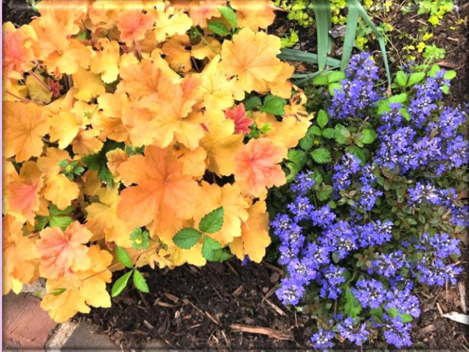
Heuchera and Ajuga