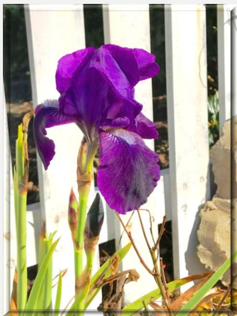
Purple Iris ~ Alice Garrard