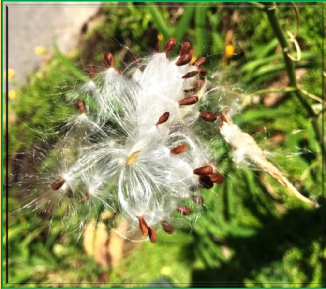
Milkweed pods attract Monarch butterflies