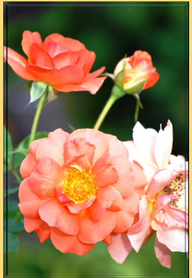
Glorious Roses