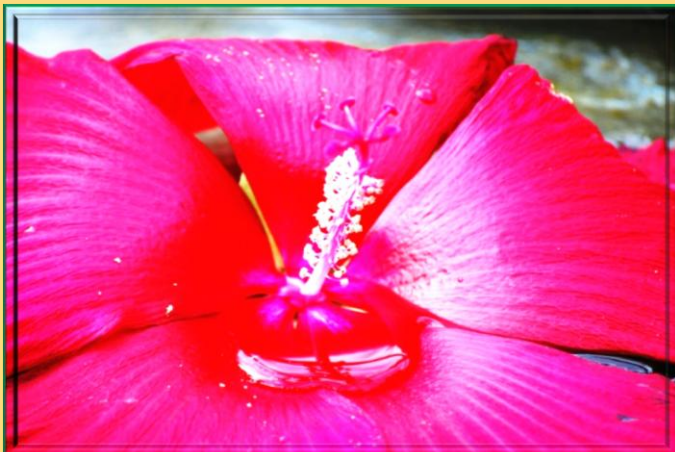
Hibiscus in the Sun