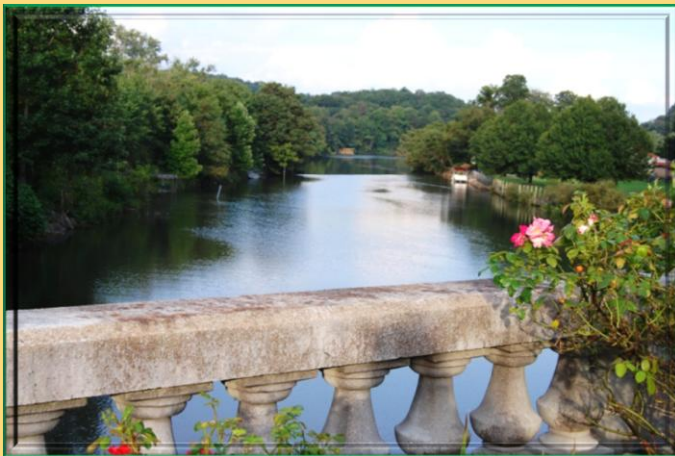
Roses and the River