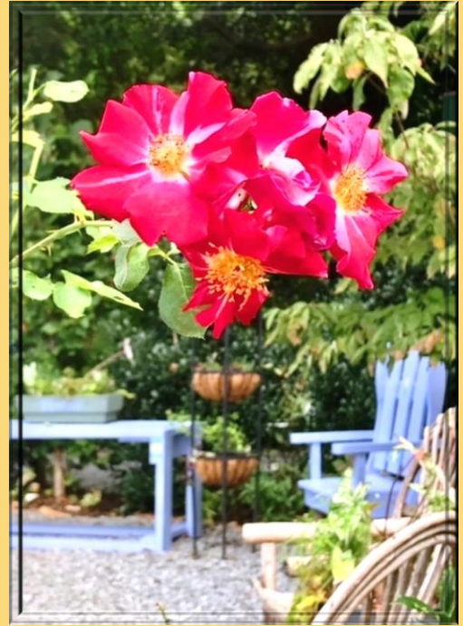
Secret Garden