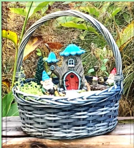
Gnome Village in a Basket created by Mitsi Chorak