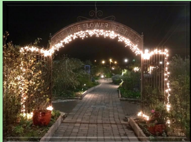
Holiday Lights in the Gardens