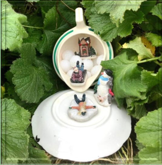
Snow Fun in a Teacup created by Lynn Lang