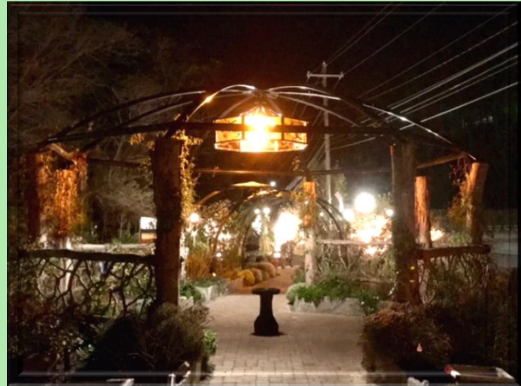
Atrium by Night in a Glow