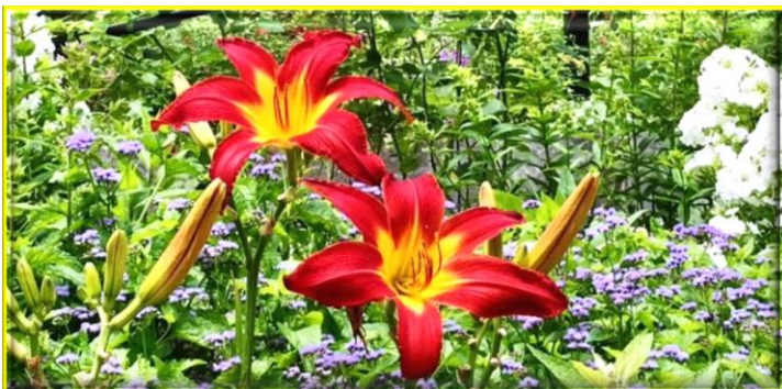
Point of View Day Lilies photographed by Alice Garrard

**Unless otherwise indicated, workshops will be held at 10:00 AM in the Outdoor Classroom at the west (Chimney Rock) end of the bridge. In case of rain, they will be held in the Community Hall at Lake Lure Town Hall. For more information, call Alice Garrard or Danny Holland at (828) 625-2540.