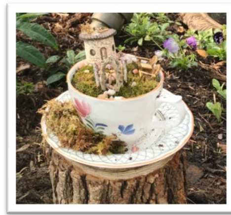
Lynn Lang's "Tea Time" envisions a garden in a tea cup.

It's almost time to light the gardens for the holidays and we need more strings of white lights and white icicle lights. Please bring your lights to a garden volunteer or drop them at the potting shed at the Chimney Rock end of the bridge. Let's set the gardens aglow for the happiest holidays ever!