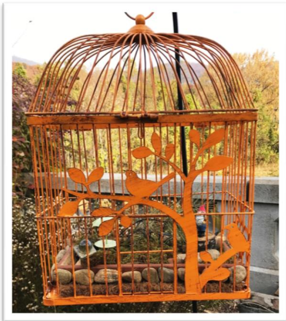
Gnomes come to play in Kathy Tanner's "Flying High," a garden in a bird cage floating above the bridge.