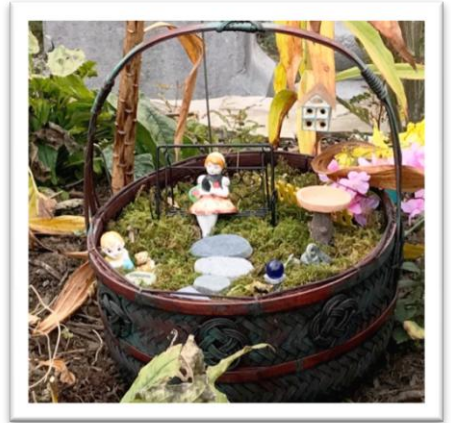
Whimsy abounds in Marily Floyd's "Basket Case"