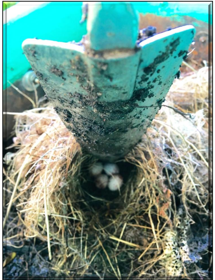
Garden volunteers recently found this wren's nest and tried to give it safe haven until the little ones hatch.