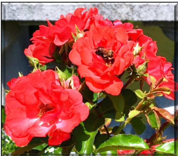
Notice the bee in this coral drift rose.