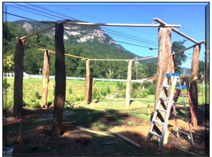
Kathy Tanner shared this photo of the atrium posts in place awaiting further framing with locally crafted ironwork. This is part of the extension of the garden path toward Boys Camp Road on the Chimney Rock end of the bridge. Thanks to our volunteers who are making this happen.