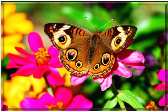
The Common Buckeye migrates from the south to colonize most of the U.S. and southern Canada. The eyespots may be used to scare away predators.