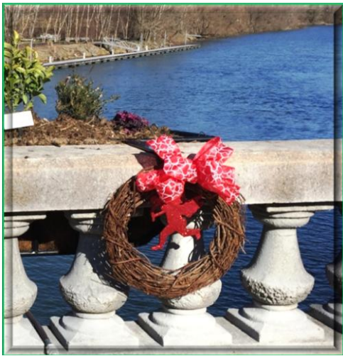
Our volunteers shared the love, honoring Valentine's Day with hearts and ribbons throughout the gardens.