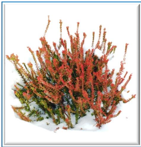
Undaunted by the snow, this heather shows off its cheerful blooms on a frosty January day.