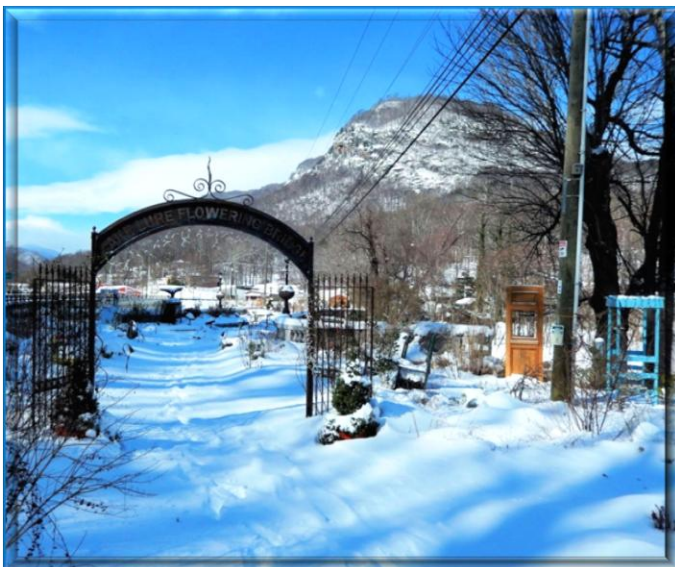
The big snow came and covered the Hickory Nut Gorge and our LLFB with a glorious white blanket.