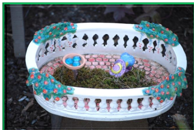
Veryle Lynn Cox's garden in a pottery balustrade is decorated for the holidays.