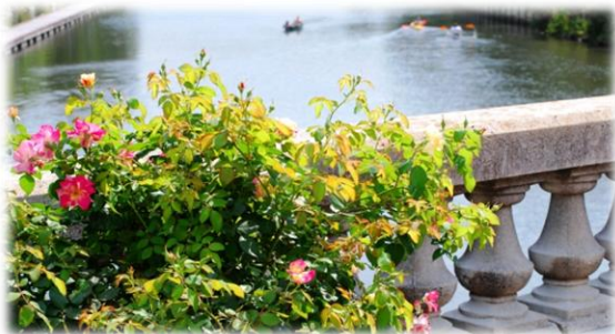
Roses adorn the balustrade above the river's gleaming surface.