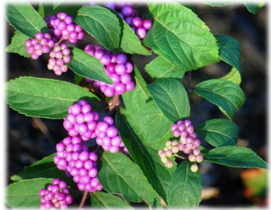
Southeast U.S. native Beautyberry

In addition to the full-page article devoted to the LLFB, we are featured on the magazine's cover as one of our state's adventures to be savored.