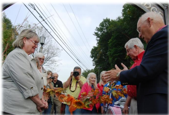
LLFB is Officially Open