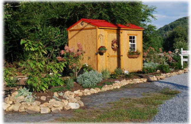
Practical and pretty

Once again donations and volunteers answered the need and our new potting shed took root in the West Gardens. The building, purchased locally, was set in place on a concrete pad, then surrounded with its own garden bed. The new shed allows volunteers to keep tools and equipment close at hand. The building's metal roof is reminiscent of the red roofs that have been part of Lake Lure's architecture since the community was founded.