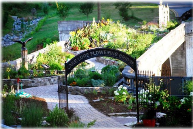
Welcome to the Bridge