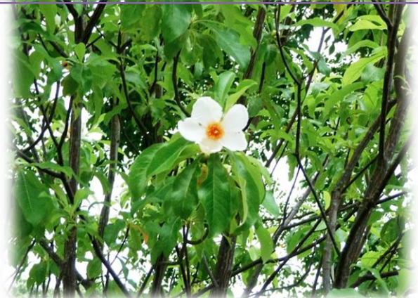
Photo above is one of the natives being considered. It's called Franklin Tree or lost camellia.

www.facebook.com/lakelurefloweringbridge