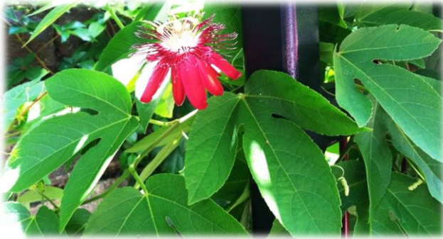
Above is the native Passionflower Vine.