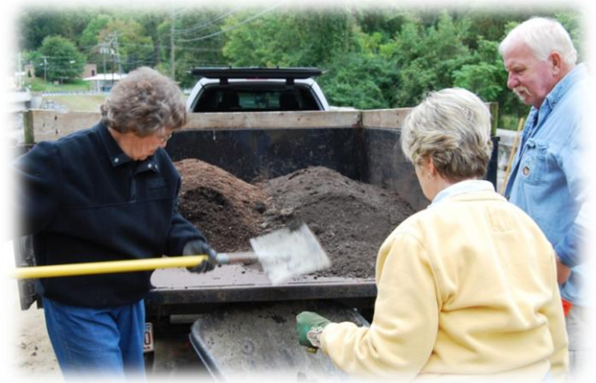
Getting the right mix of nutrients is important.