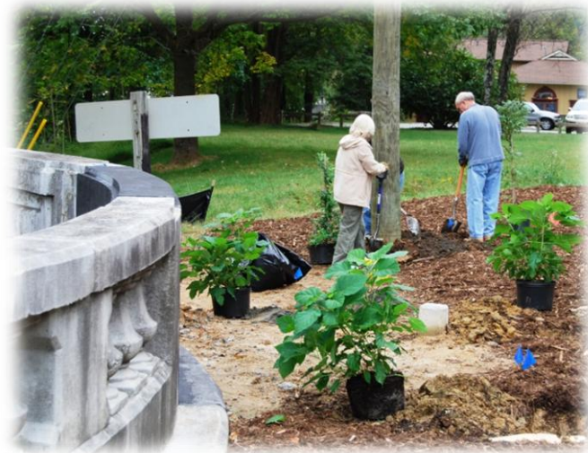
Volunteers dig in to create the East Gardens.

Anyone can become a Friend of the Lake Lure Flowering Bridge. We accept donations and have made available a Friends membership form on our website. We are working hard to be good stewards of donated funds, making each dollar pay off. Please help us continue to raise the funds that will enable us to make this dream come true for generations to come.