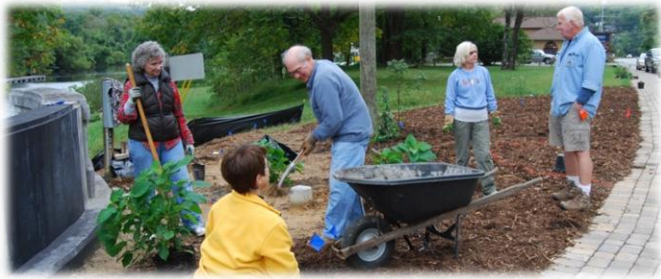
Our crew from the first planting day got us started off right.

Our next workday on the Lake Lure Flowering Bridge will be Saturday, November 3 at 9:00 AM.